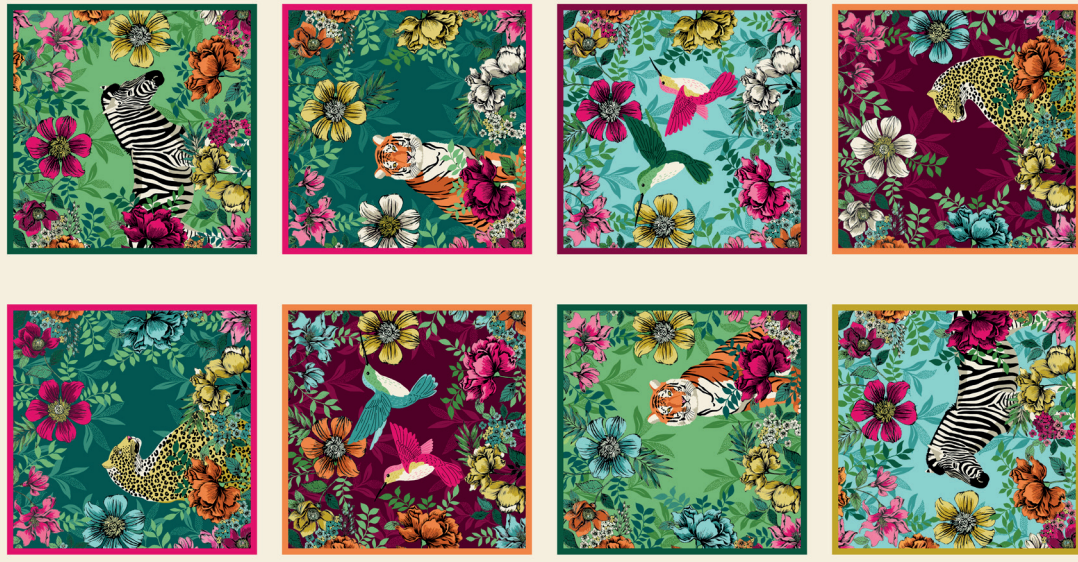
2429/1 Panel (actual size 24" x 44" / 60 x 112cms)