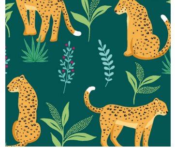
2425/T Cheeky Leopard