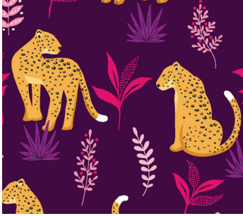
2425/P Cheeky Leopard